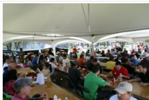
Dealers filled the big top to enjoy the crawfish.