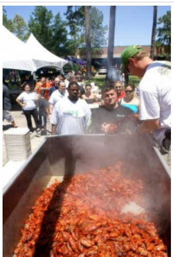
Dealers lineup for hot crawfish - the steam is rising!

A big 12voltnews.com “hats off” to all the Eagle staff that worked so hard to produce this year’s very successful Eagle Distributor’s 12volt Expo.